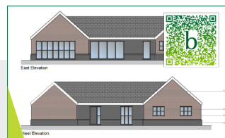
New horticultural worker's permanent dwelling