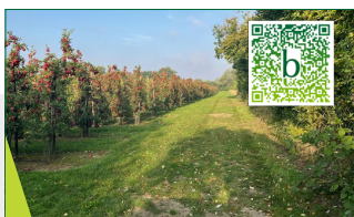
New dwelling to support fruit farm