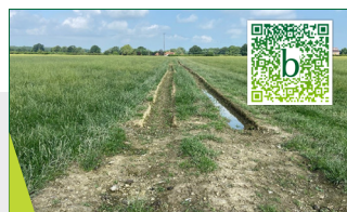
Justice indeed for agricultural dwelling