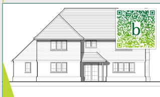
New Permanent 4 bedroom AOC dwelling