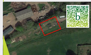
Farm worker's temporary dwelling for suckler cow enterprise